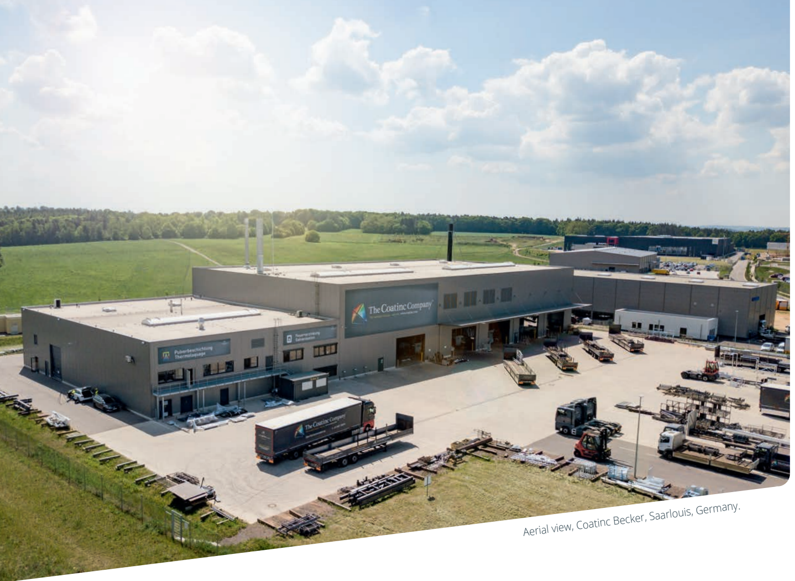
Aerial view, Coating Becker, Saarlouis, Germany.