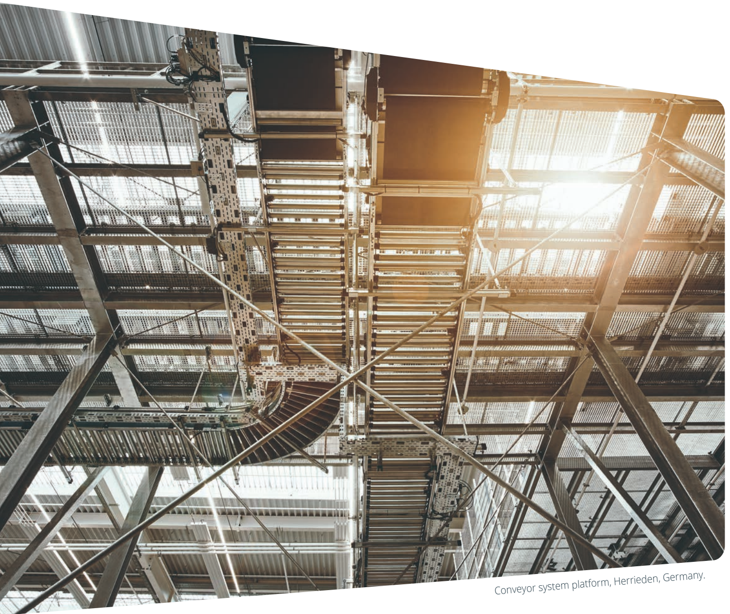
Conveyor system platform, Herrieden, Germany.