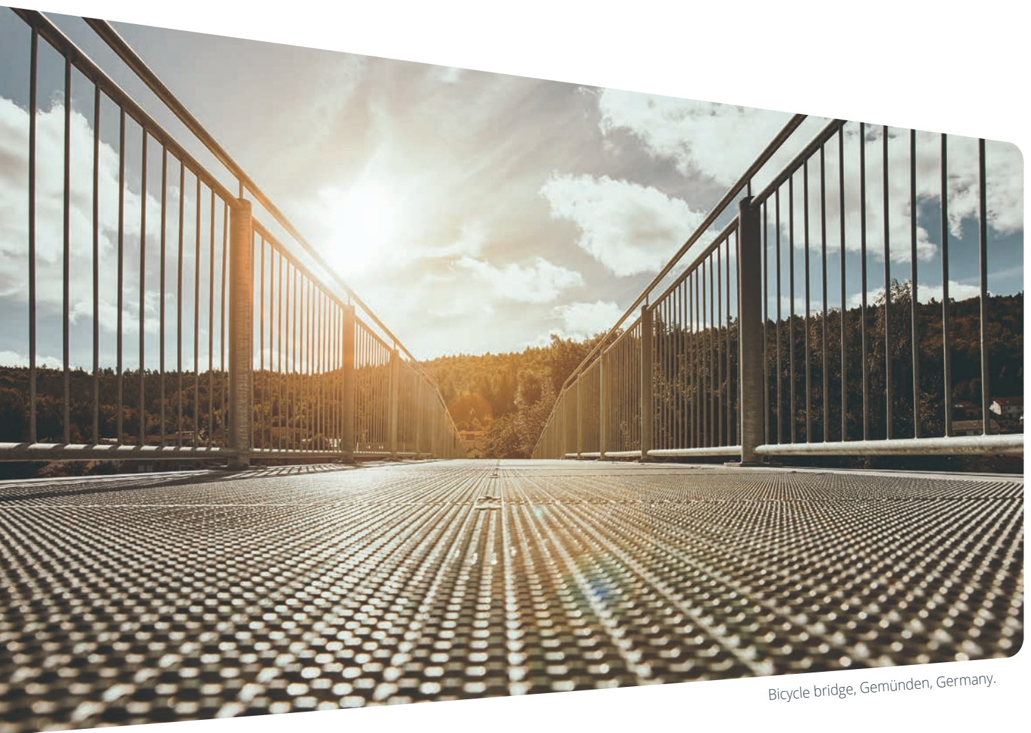
Bicycle bridge, Gemünden, Germany.